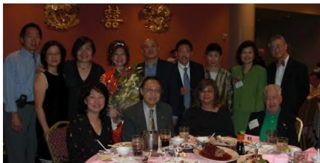
CPC Table at Teen How Taoist Temple Officers' Installation on May 2, 2009, at Ocean Palace Restaurant.